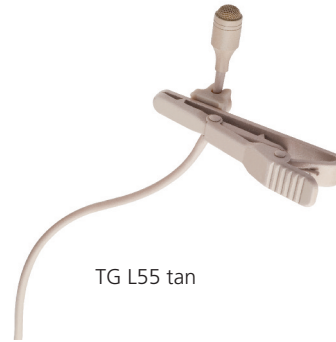
TG L55 tan